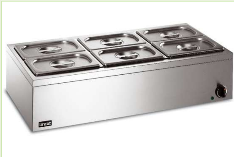
Chafing Dish Rolltop